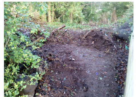
L to R: clearing brushwood in September, hired gardener at work, the ground-level space appearing.