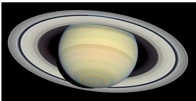
SATURN - Hubble Space Telescope 22 March 2004